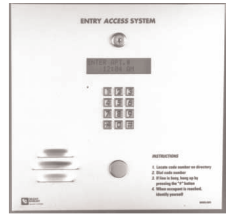
5083 Hands-free Entry System